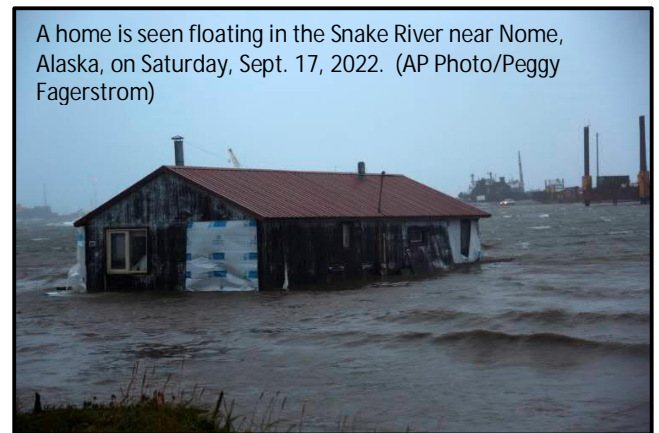
A home is seen floating in the Snake River near Nome, Alaska, on Saturday, Sept. 17, 2022.