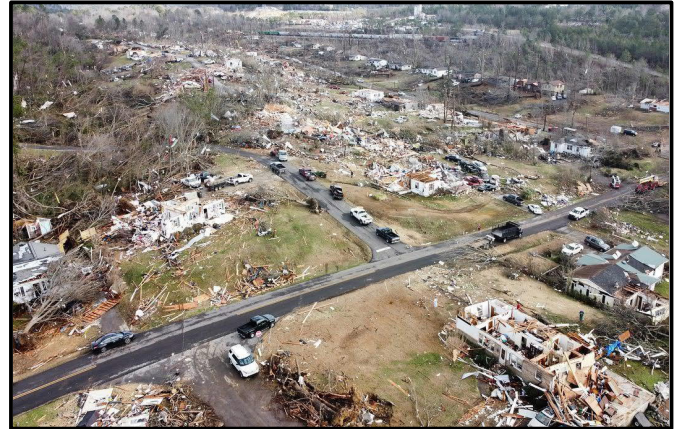
Drone footage from Fultondale reveals the damage from an overnight tornado on January 25.