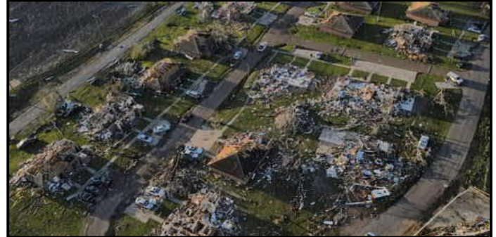
Damage is seen on properties in Rolling Fork, Miss.