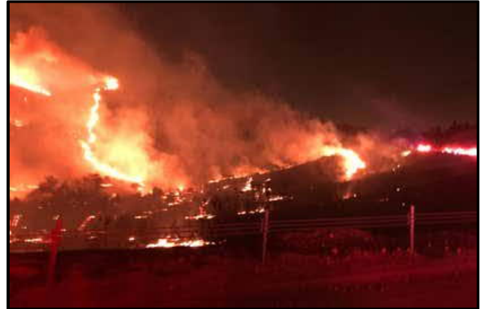
A view of the Creek Fire, which was burning on and around Camp Pendleton, a sprawling U.S. Marine Corps base in Southern California.