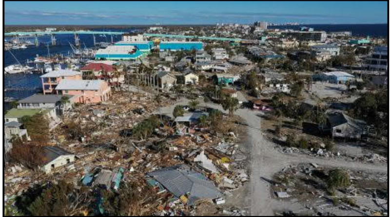
Fort Myers Beach, Florida, sustained severe damage from Hurricane Ian.