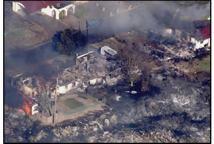
Spur Fire destroys homes in Bagdad, Arizona.