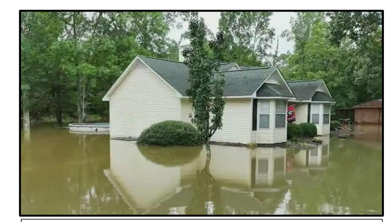
Flood damage extensive in Chattooga and Floyd counties (FOX 5 Atlanta).