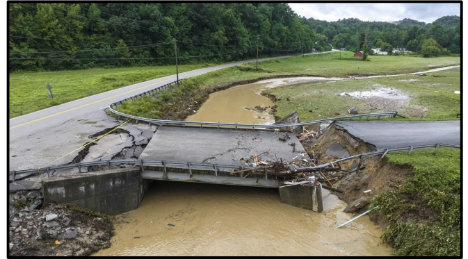
A bridge across Grapevine Creek at Chavies School Road in Perry County, Ky., is heavily damaged from flooding on July 28, 2022.