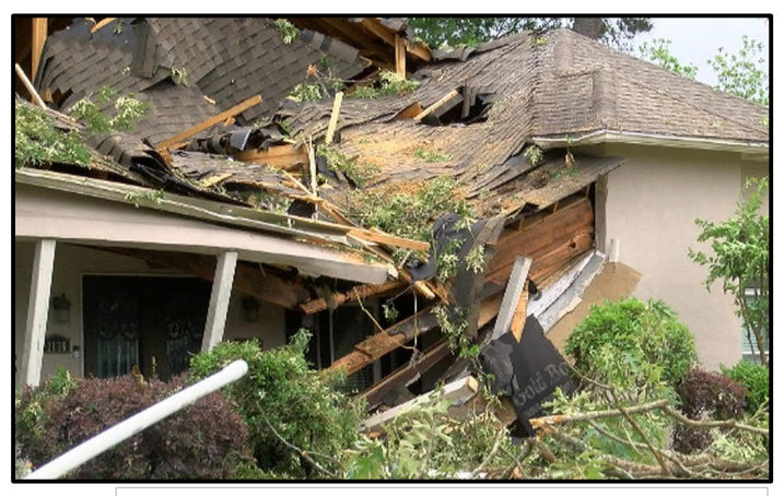
Tornado damage extensive in Jackson, MS neighborhoods.