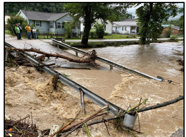
High water destroys a bridge in Hugheston in Kanawha County.